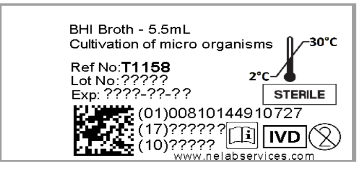
The following NEL part numbers will be affected by this change: